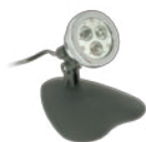
3-Watt Bullet Spotlight