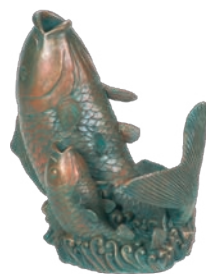
Double Fish Spitter